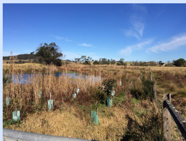
Narrawallee Creek– looking south (June 2018)