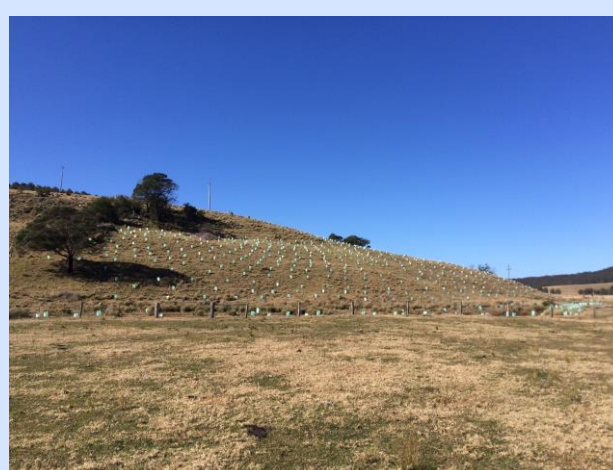
Currowar Creek – looking east (June 2018)