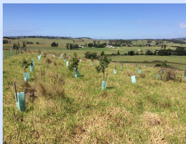
Hill – looking south (June 2018)