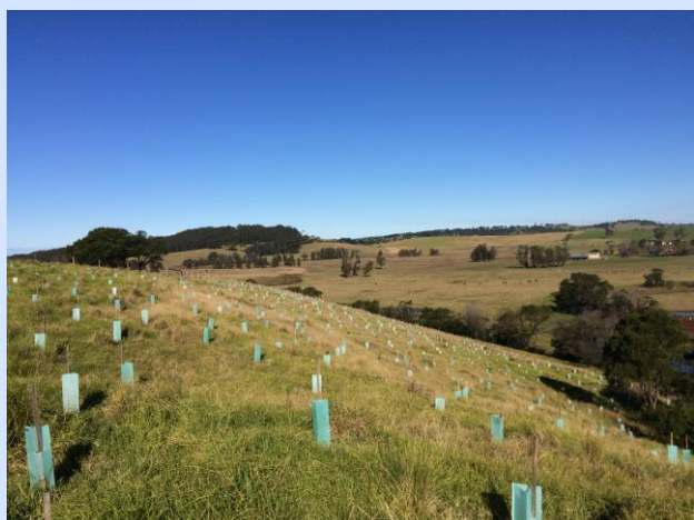
Hill – looking south (May 2017)