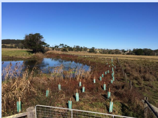
Narrawallee Creek– looking south (June 2017)