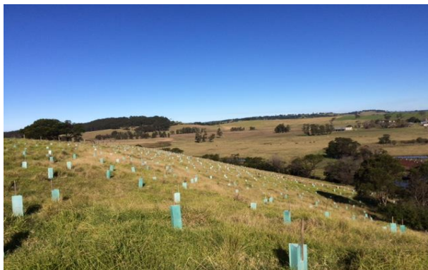
Figure 1: Planting on the top of the hill (2.8ha) looking towards Pigeon House Mountain.

The landholder was concerned about the lack of vegetation on his farm for livestock shade and potential land slippage on the steep grazing hill. A small land slip has occurred on the neighbouring farm in 2016 near the project site.