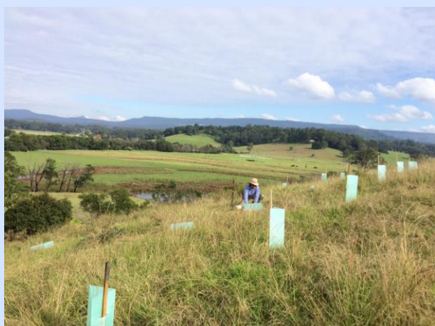
Hill – looking west (April 2017)