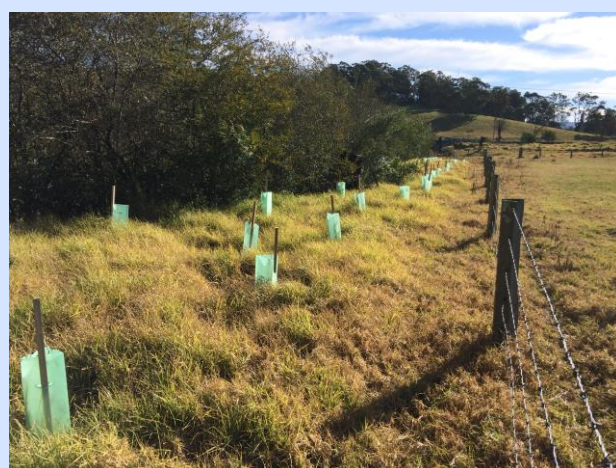
Narrawallee Creek – looking east (June 2018)