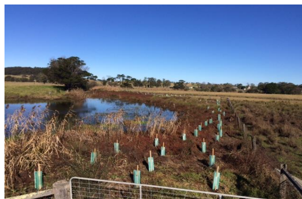
Figure 2: Planting along Narrawallee Creek, re-establishing and replacing Black Wattle with a diverse riparian corridor.

replacing a monoculture of Black Wattles ( Acacia mearnsii ) which are dying and regenerating along the corridor.