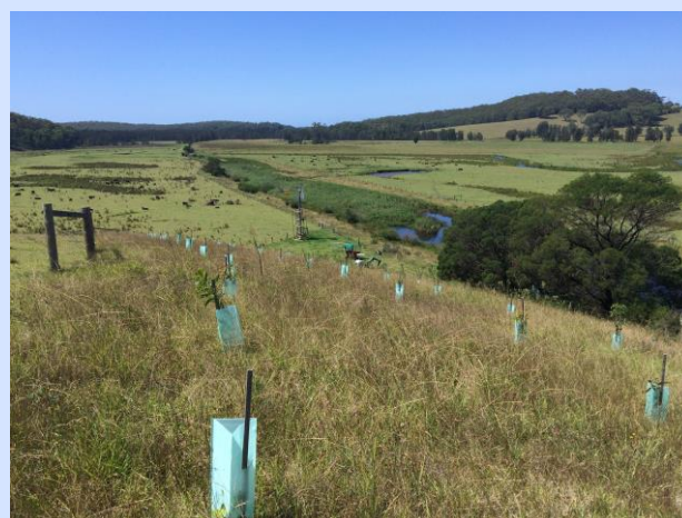
Hill – looking east (June 2018)