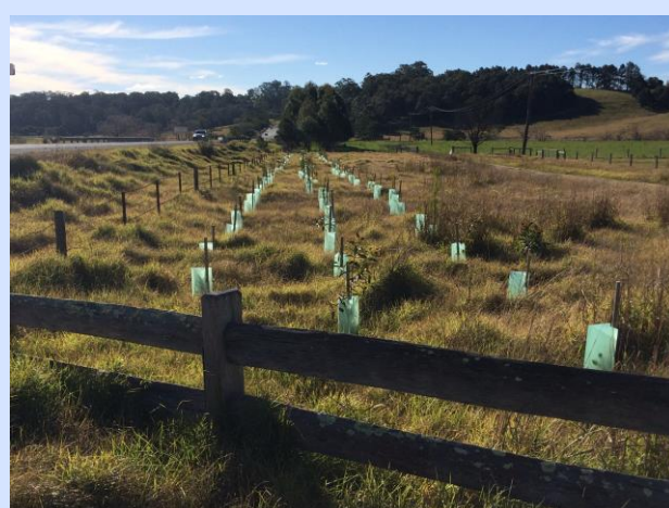
Highway Corridor – looking north (June 2018)