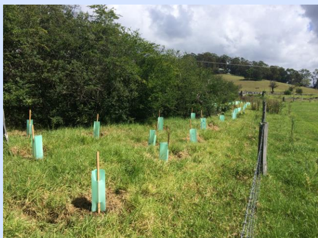
Narrawallee Creek – looking east (March 2018)