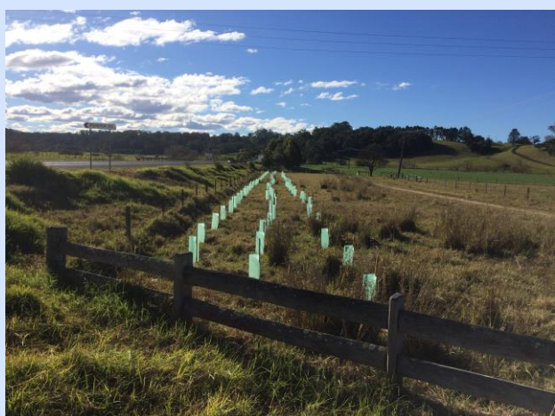
Highway Corridor – looking north (May 2017)